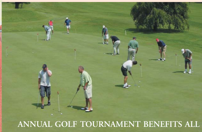
ANNUAL GOLF TOURNAMENT BENEFITS ALL