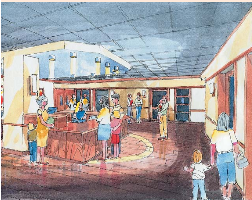
Architectural rendering of Nurses Station at The Neely Pediatric Bone Marrow Transplant Center