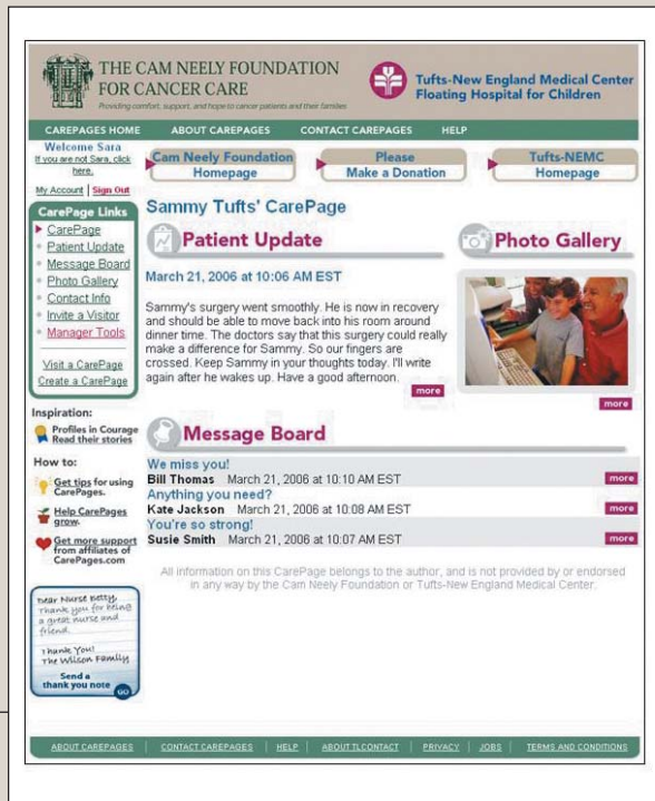
Sample of a personalized CarePage

If you would like to support our CarePages program, please call 617-346-5900. For more information, log on to www.carepages.com/nemc .